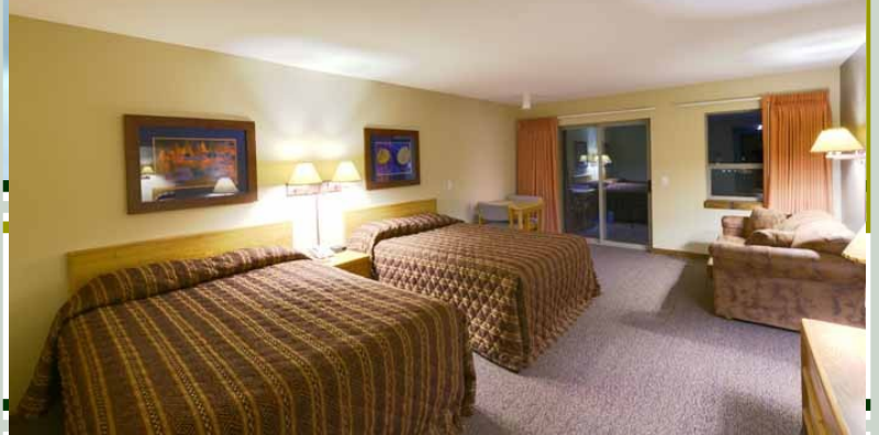
Picture of the reserved room...

For more information, you can visit: www.hmcmissionwomen.weebly.com